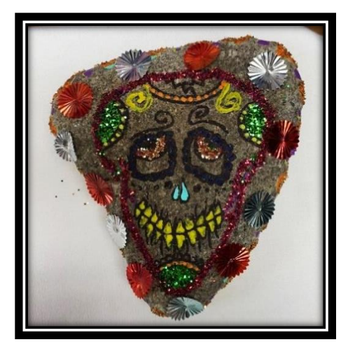
Crystal Moore - Winner